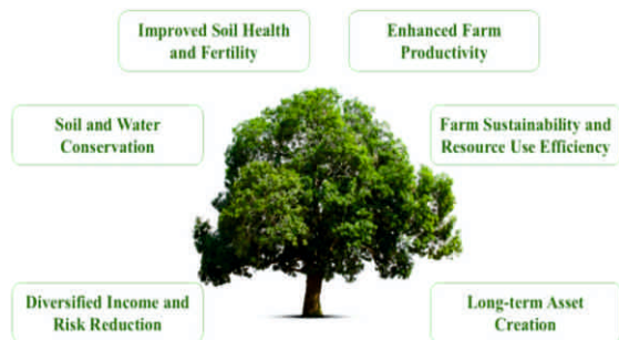
Key Advantages of Agroforestry

The following advisories have been developed as a practical guide for farmers, particularly beginners, interested in adopting agroforestry. They provide season-specific recommendations on the selection, establishment, and management of agroforestry systems to support informed decision-making, improve productivity, conserve natural resources, and maximize long-term benefits.