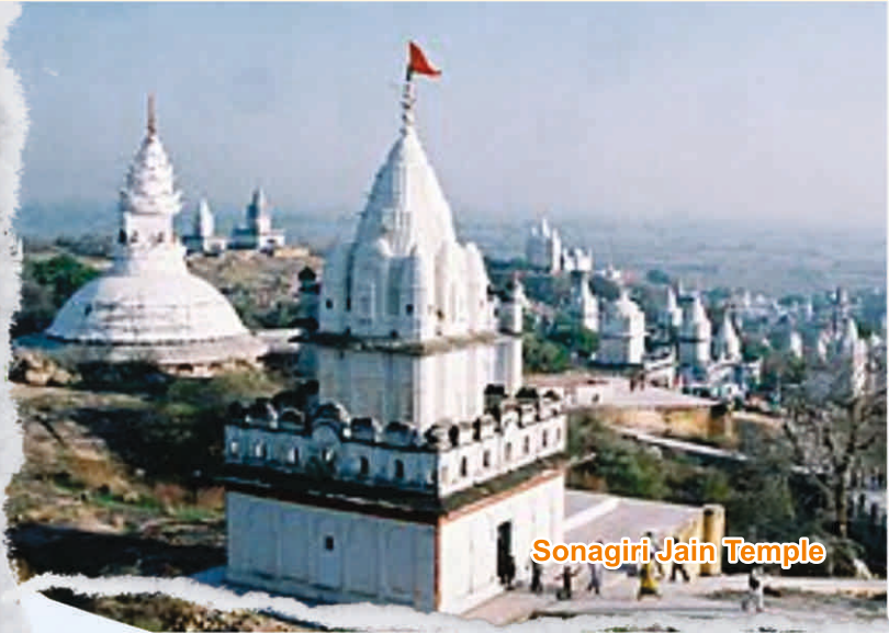
Sonagiri Jain Temple