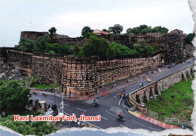
Rani Laxmibai Fort, Jhansi