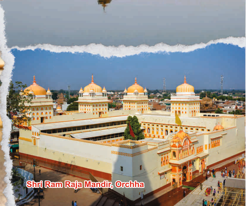
Shri Ram Raja Mandir, Orchha